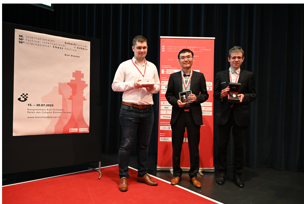
2 nd GM Bogdan-Daniel Deac, 1 st GM Yangyi Yu, 3 rd GM David Navara