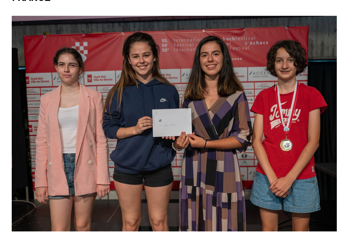
Biel International Chess Festival 2022 - Ladies ACCENTUS Quadriathlon